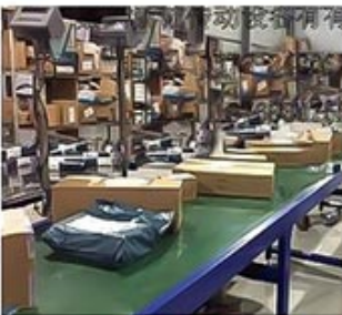
LOGISTICS AND TRANSPORTATION