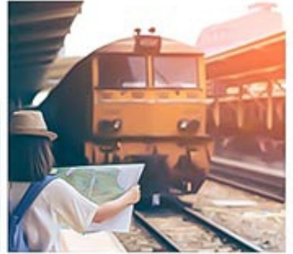
RAIL TRANSPORTATION INDUSTRY