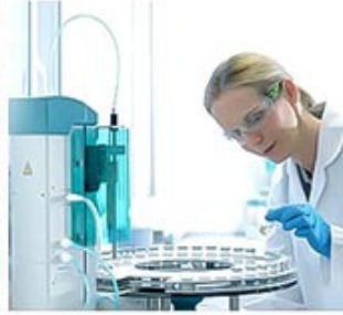
MEDICAL DEVICE INDUSTRY