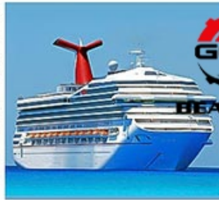
SHIP REPAIR INDUSTRY