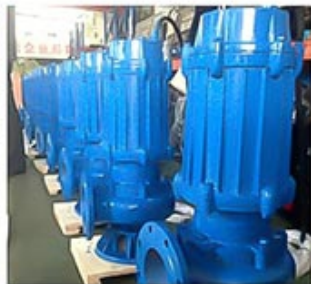
PUMPS & FLUIDS INDUSTRY