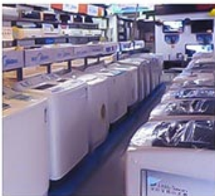
DOMESTIC ELECTRIC APPLIANCE