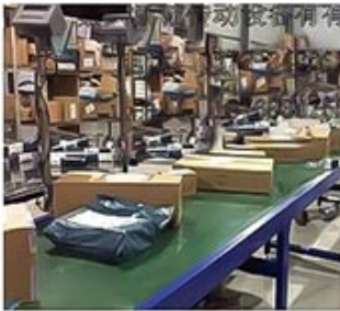
LOGISTICS AND TRANSPORTATION