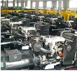
ELECTRIC MOTOR INDUSTRY